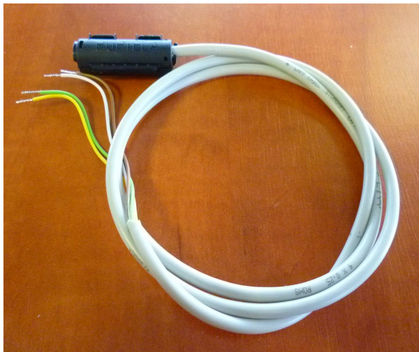
4 image. 4 wires of easyCAN which have to be connected to the device